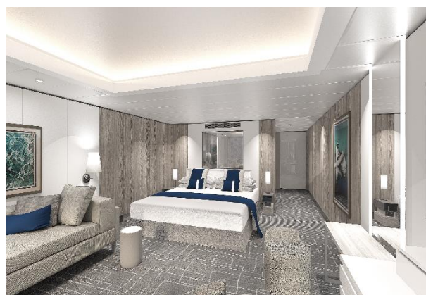
S2 rendition images

Edge Class Suites include butler services, indulgent amenities plus some exclusives, including access to The Retreat Lounge, The Retreat Sundeck, and private dining in Luminae reserved for our Suite Class guests